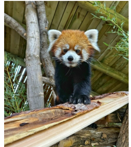
See a Chinese red panda as part of the zoo's Asian Highlands exhibit.